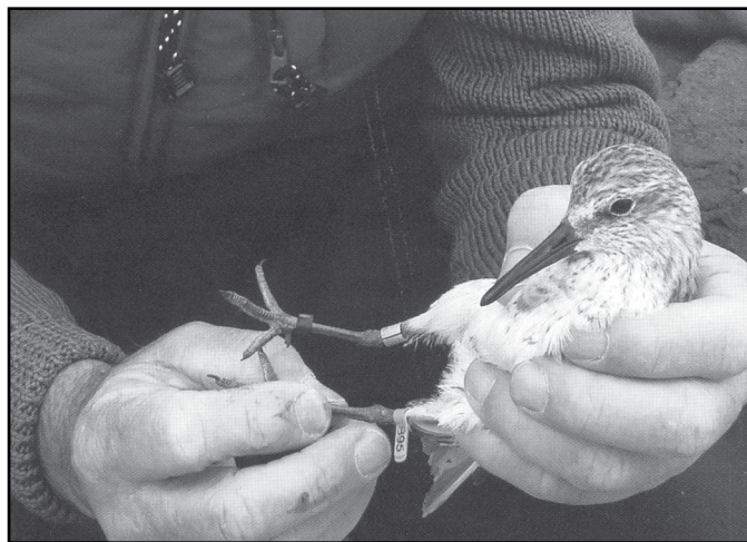
B95, as he appeared in his gray nonbreeding plumage at Rio Grande, November 8, 2007