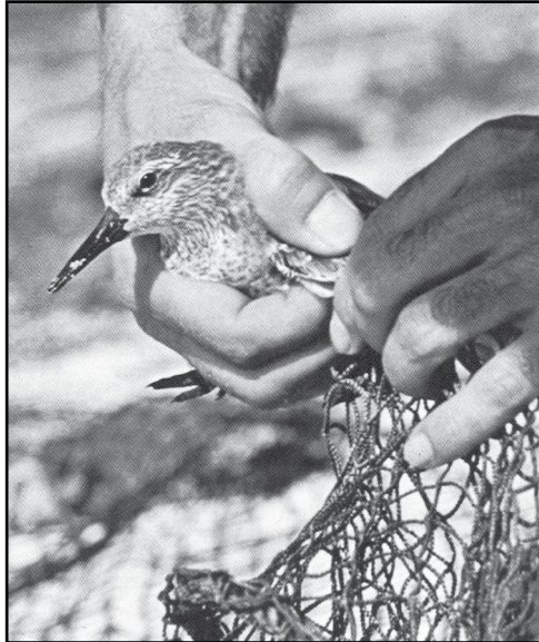
A worker frees a knot from a cannon net.